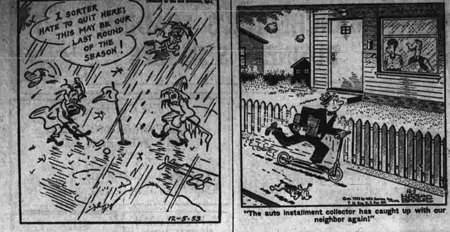
"The auto installment collector has caught up with our neighbor again!"