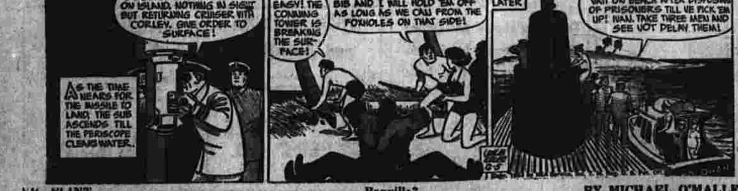
Not Long Now