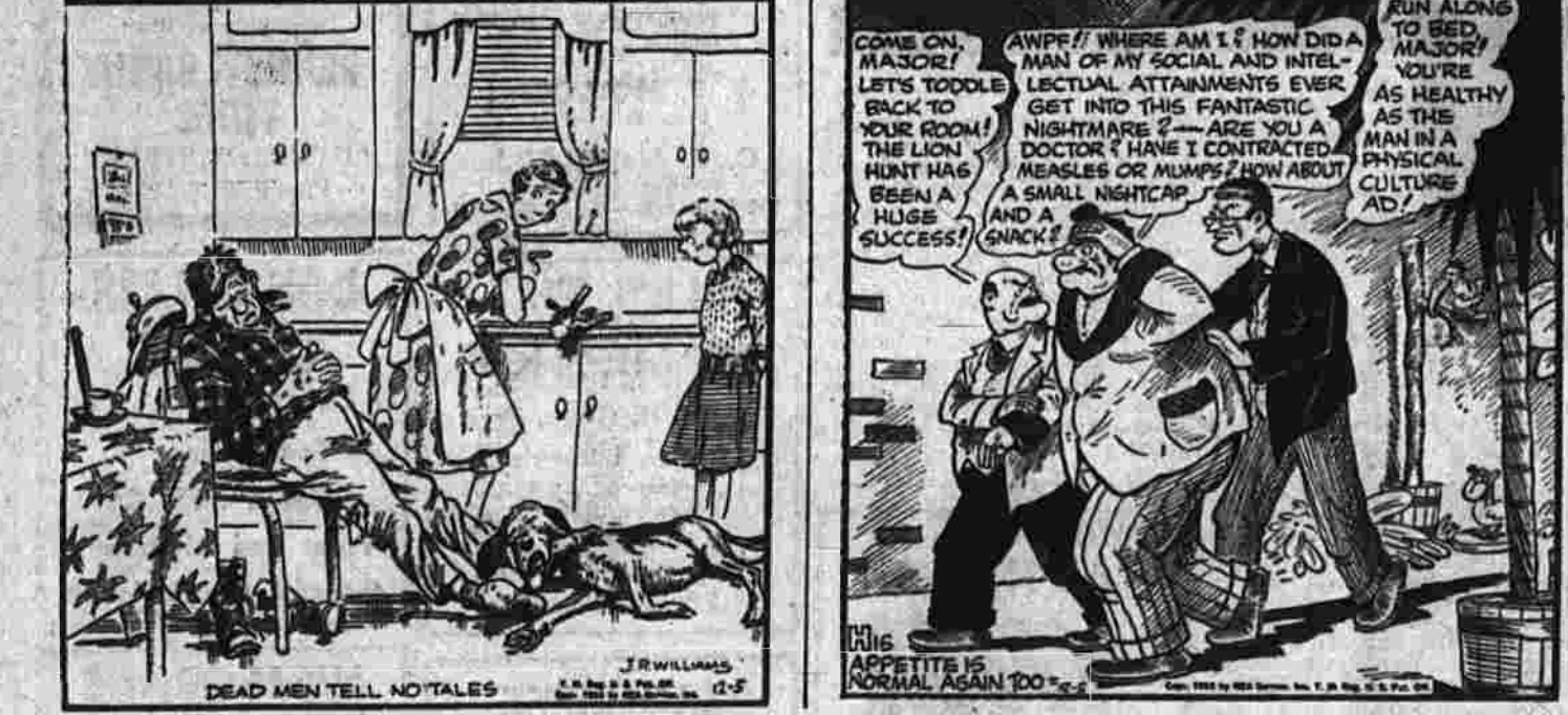
Something To Think About