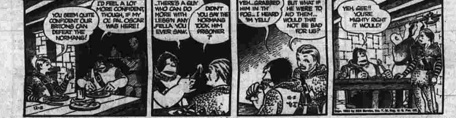
Something To Think About