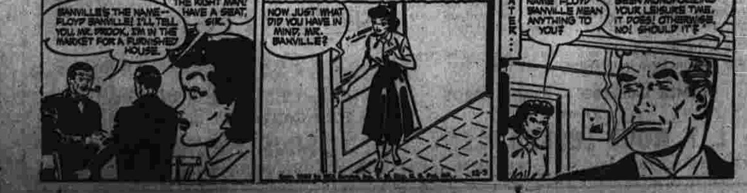
Not Long Now