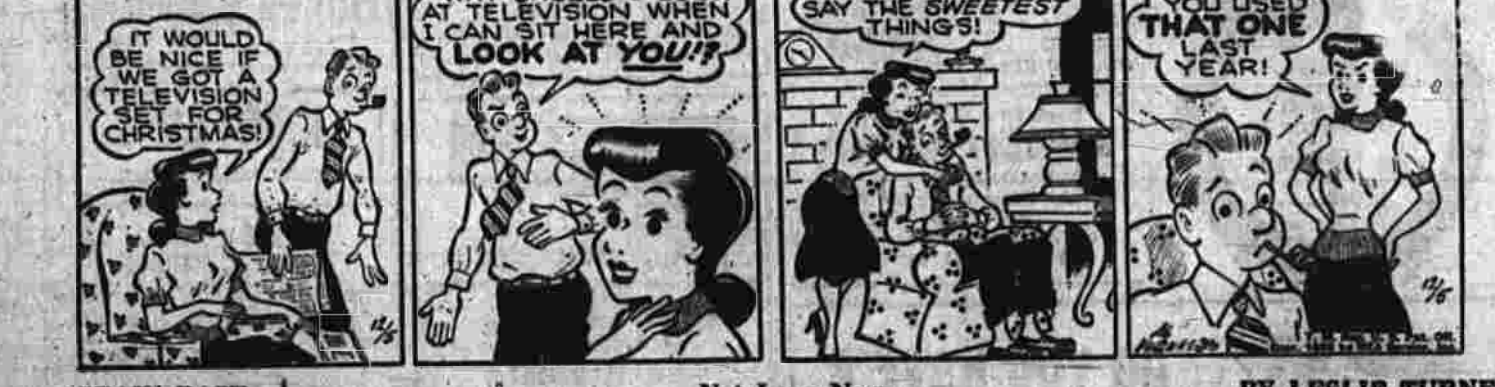
Not Long Now